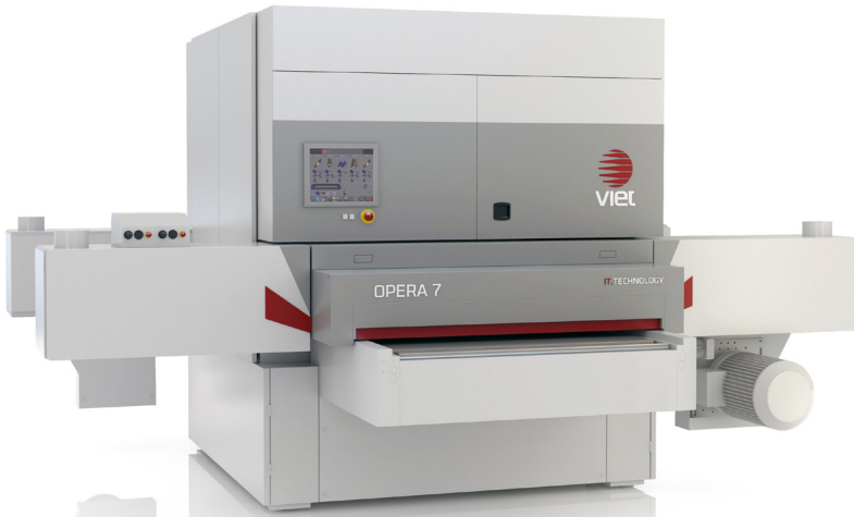
VIET Opera 7 The ART of sanding!