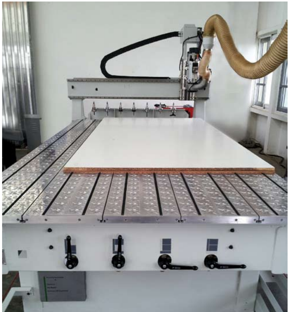
Work table is available in 4' x 8' and 5' x 10' and is accessible on all sides. The 5' x 10' version is equipped with smart vacuum sectioning in 4 areas to ensure maximum hold. In addition, the machine has been designed so vacuum pumps can be placed under the table saving space.