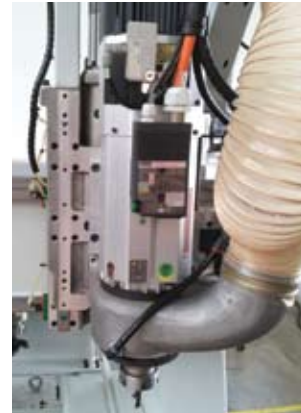
Powerful 15HP HSD Electro-spindle, ISO or HSK