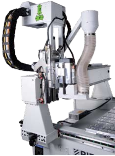
Heavy Duty Steel Gantry