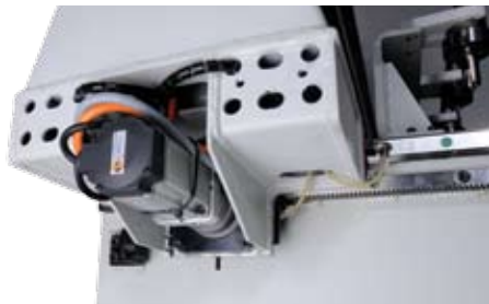
X Axis helical rack & pinion with precision linear guides and digital servo motors guarantee high precision and high quality cut