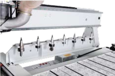
7 position rack tool changer, ISO or HSK allows for increased productivity and flexibility