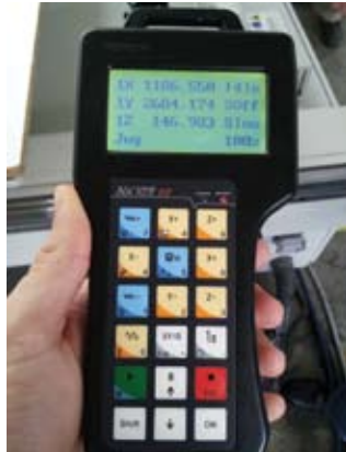
Easy to use DSP numerical control with handheld device