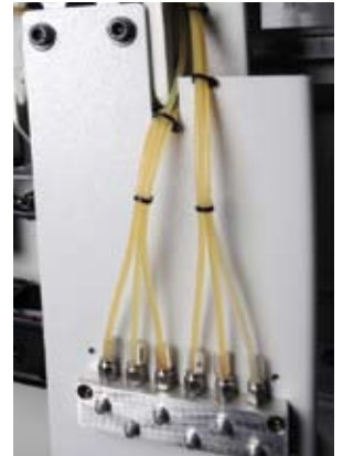
Central Lubrication makes maintenance simple